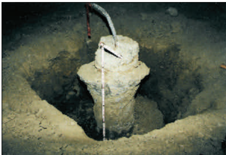
FIGURE 1 TYPICAL PICTURE SHOWING THE MUSHROOMING OF THE PIER TOP

analyzing laboratory tests of the soil and rock samples, the geotechnical engineer recommended pier foundations to be used at this site. The design and guidelines for execution were presented with clearly assigned responsibilities of each party within the project. Everything seemed to be in order until the work started. The grading of the surface and drilling for pier installation was found to be more difficult than expected. This caused delays and deviations from the specifications. It was not until after completion and payment for the work that the owner, the structural engineer, and the construction manager insisted the drilled pier installations were defective and had to be corrected.