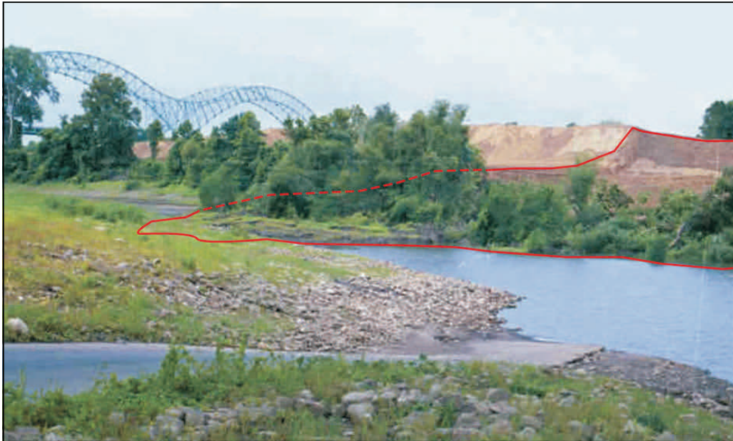
FIGURE 1 LANDSLIDE INTO A WATER CHANNEL DURING THE PLACEMENT OF FILL

An investigation of a landslide was undertaken by MEA to determine the cause of the failure (see Figure 1). The failure occurred during the placement of fill above soft clay soils. The site required up to about 20 ft. of fill to bring it above flood elevation. Most of the fill was required along an earth-sloped water channel.