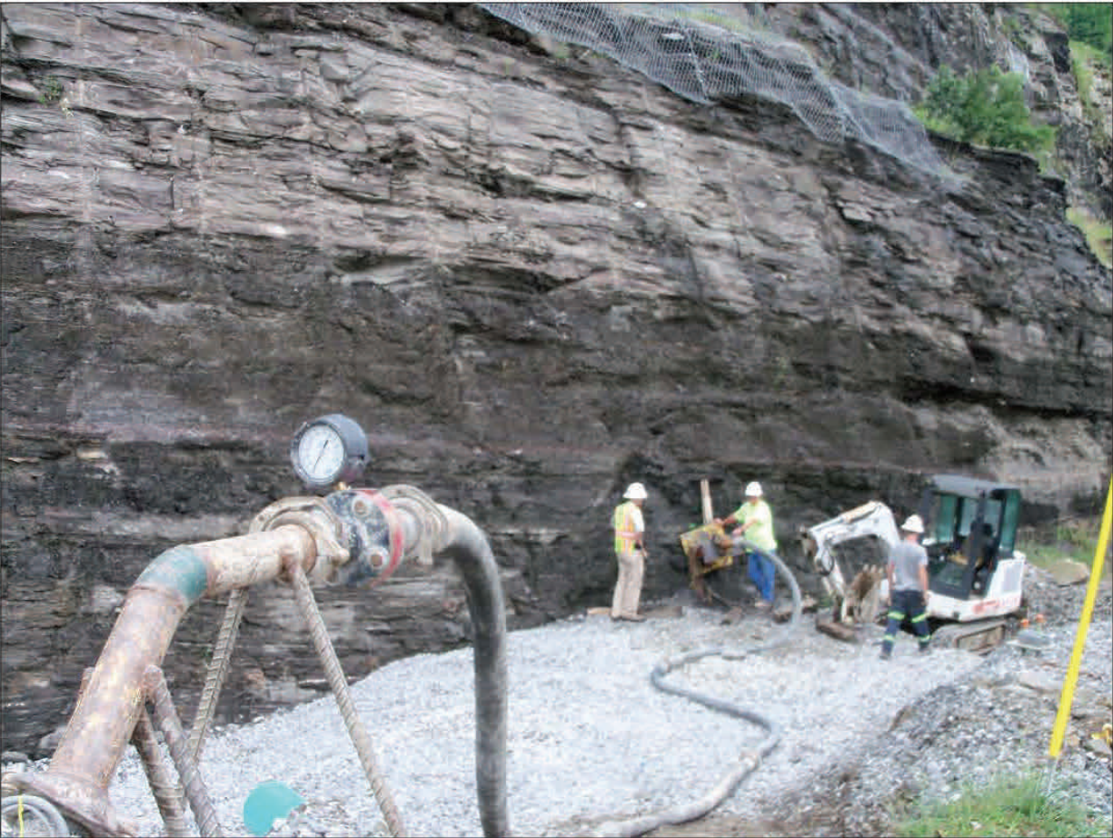
FIGURE 3: GROUT INJECTION WITH PRESSURE INTO THE MINE OPENING FILLED WITH CAVE MATERIAL ALONG THE ROCK CUT.

$3 million. This was in lieu of stabilizing the entire mine beneath the structure, which would be conventionally done.