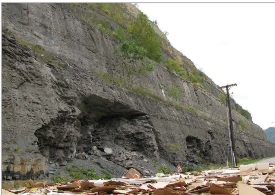
FIGURE 2: MINE OPENINGS IN 400 FT. HIGH ROCK CUT. MINE ROOF CAVED UPWARD OVER TIME.

In addition to the existing rock cut concerns, MEA discovered during its investigations that evidence existed that subsidence had already occurred at the existing commercial building. According to a survey done around the building, about 4 in. of subsidence had occurred, resulting in localized ponding on its flat roof. Under further investigation, it was found that the building rested on another abandoned coal mine which operated from the 1940s to the late 1960s. Based on information collected from drilling into these old coal workings, the mine was found to be open, dry and about 160 ft. deep.