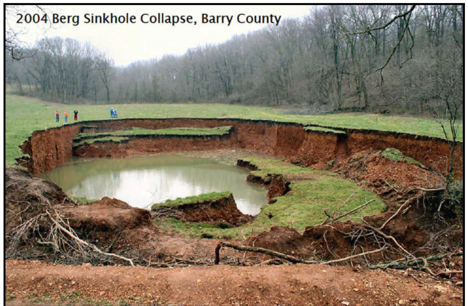
FIGURE 2: LARGE SINKHOLE FROM A LIMESTONE CAVERN COLLAPSE

the complex/erratic nature of the geologic/geotechnical conditions. For example, merely drilling borings can result in missing critical subsurface subsidence-prone features which are literally 10 ft. away. Consequently, because of the more extraordinary site exploration challenges and the number of risk-related factors, the most cost-effective investigation and mitigation approaches depend on the understanding of the site and the experience and training of the investigator.