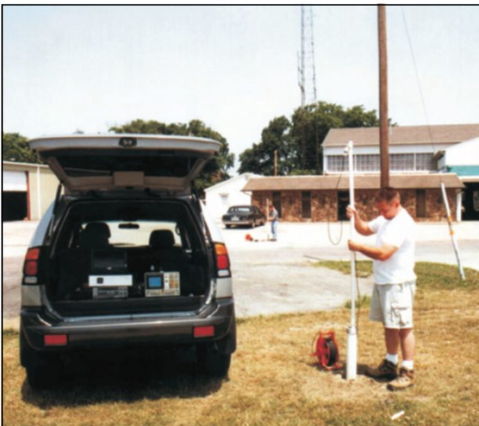
FIGURE 1 MEA BOREHOLE RADAR SYSTEM: ANTENNAS BEING LOWERED INTO BORINGS IN ORDER TO CONDUCT A CROSS-HOLE SURVEY

If two antennas are lowered down boreholes to the coal seam, a radio signal transmitted from one antenna will transmit through the coal to the receiving antenna with a certain attenuation rate (see Figure 2a)/ In a homogeneous coal seam this rate will be determined by the characteristics of the coal such as resistivity, moisture content, and coal seam thickness. In this case, the attenuation will be a function only of the distance between the antennas—the greater the distance, the weaker the signal.