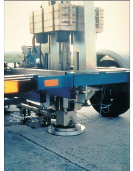
FIGURE 3 FALLING WEIGHT DEFLECTOMETER EQUIPMENT USED TO LOAD TEST THE PAVEMENT