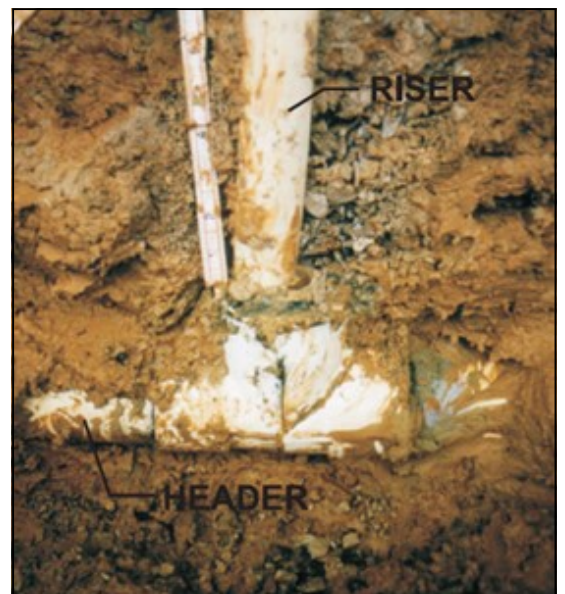
FIGURE 2 TYPICAL FRACTURING FOUND AT THE RISER/HEADER CONNECTION

From a borehole camera inspection it was discovered that there was a significant fracturing of the sub-floor plumbing. The fracturing was concentrated at the connector of the rise pipe and header (see Figure 2). Also from manometer survey and photographic information it was established that the pool floor and wall had settled. Normally, such pool settlement would not affect the operation of the pool but the pool floor plumbing was particularly sensitive to compressibility of the fill as the