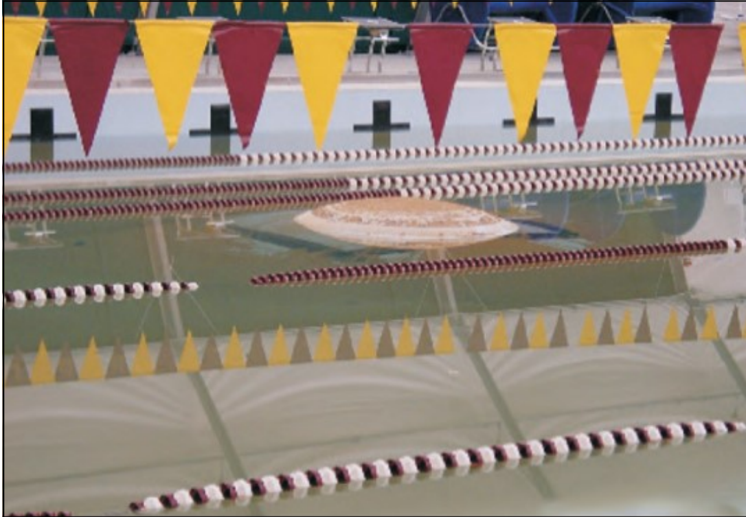
FIGURE 1 VERY LARGE BUBBLE IN THE FLOOR LINER WHICH GREW OUT OF THE WATER DURING THE OPERATION OF THE POOL

From the beginning of the operation of the Olympic Pool in Tennessee there were signs of trouble. The water in the pool would not clear up, the pool liner had bubbles which appeared to grow over time, and the pool floor needed constant vacuuming. Initial thoughts by the contractor who constructed the pool was that filtration plumbing, which was installed below the pool floor, contained a significant amount of construction debris which was making its way into the pool. As the pool continued to operate, the blisters in the liner grew, which was speculated to be the result of a high groundwater table. Eventually one of these bubbles became so large that it rose above the water surface. To deflate this now very significant liner bubble, it was punctured spewing soil and water (see Figure 1).