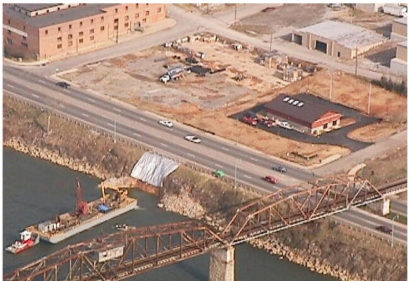
FIGURE 3 PHOTOGRAPH SHOWING THE RESULTING SLIDE FROM RIVERSIDE EXCAVATION