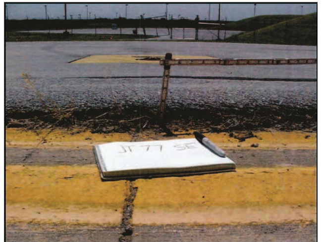
FIGURE 1: DIFFERENTIAL HEAVE OF 1.3 IN. FROM SUBGRADE SWELLING BETWEEN THE TAXIWAY

Problems began during pavement construction when the prepared subgrade became wet from precipitation. This resulted in egregious softening and swelling, which destabilized the overlying subbase. The potential for swelling and softening can be seen in constructed pavement with the swelling heave differential of about 1.3 in. between the concrete and asphalt pavement (see Figure 1).