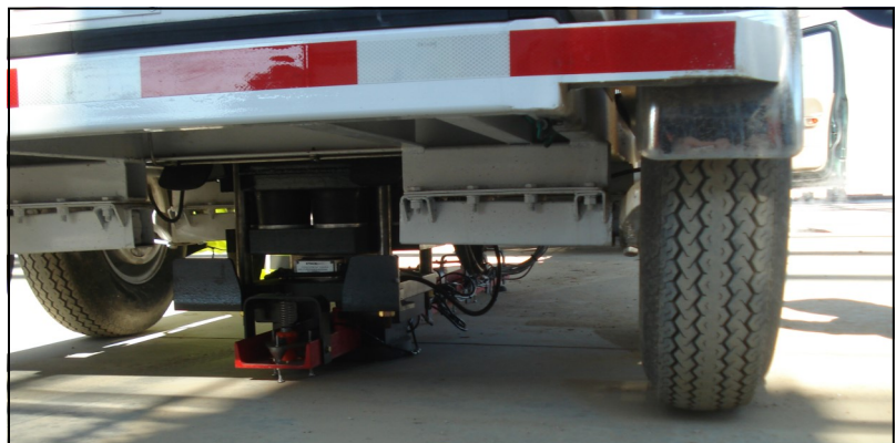
FIGURE 2: HWD PERFORMING TEST OF HANGAR SLAB

When modeling the HWD deflection characteristics of the slab