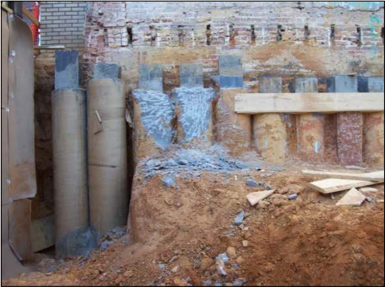
FIGURE 3: SUCCESSFULLY INSTALLED MODIFIED SECANT WALL CONSISTING OF STIFF CONCRETE SHAFTS THAT PROTECTED IMMEDIATE EXISTING BUILDINGS