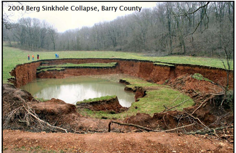
FIGURE 2: LARGE SINKHOLE FROM A LIMESTONE CAVERN COLLAPSE

Site investigation of a construction site for subsidence potential from karst conditions is one of the more difficult challenges due to the multi-variable site factors and the complex/erratic nature of the geologic/geotechnical conditions. For example, merely drilling borings can result in missing critical subsurface subsidence-prone features which are literally 10 ft. away. Consequently, because of the more extraordinary site exploration challenges and the number of risk-related factors, the most cost-effective investigation and mitigation approaches depend on the understanding of the site and the experience and training of the investigator.