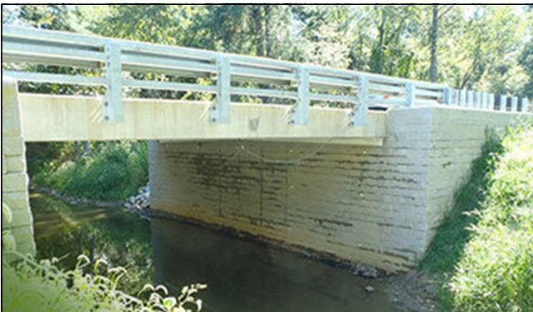
FIGURE 3: BRIDGE REINFORCED ABUTMENTS

Reinforced soil systems are extensively utilized as retaining structures and in slopes, as well as for other uses, due to their advantages over more conventional solutions. As cost-effective structures, they can easily be installed in a short period of time in all weather conditions. Because of their flexibility, these structures respond well against earthquake load. Their flexibility also makes them a very competitive alternative at sites with compressible foundation soils since they can tolerate higher settlement than rigid structures.