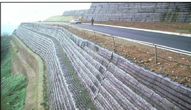
(U.S. DEPT. OF TRANSPORTATION, FHWA-GEC110)

According to Federal Highway Administration (FHWA), there are approximately 600,000 bridges in the United States, and many of them have functional or structural deficiencies. Because of financial issues, the repair or replacement of these structures has been challenging. As a result, the use of more economical means of bridge construction such as MSE (steel reinforced) and GRS (geosynthetic) abutments has been of interest