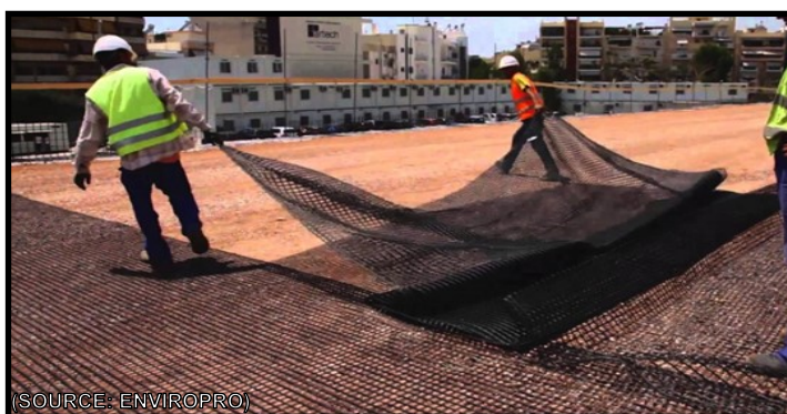
FIGURE 2 PLACEMENT OF GEOGRID OVER COMPACTED CONTROLLED FILL

RSS systems can be designed for various slope angles up to vertical, with linear to sharp curvilinear alignments and to various heights. RSS systems have been known to reach 242 ft. high. One of the restrictions for its use is the need to have sufficient embedment of the reinforcement in order to develop the necessary resistance against the geogrid failure from slipping (pulling) out of the controlled compacted fill. However, in many instances this is not problematic, or can be solved in some manner. Figure 3 shows a vertical 24 ft. high RSS used for a landfill. Figure 4 shows a completed steeply sloped RSS which is 80 ft. high used for a road embankment.