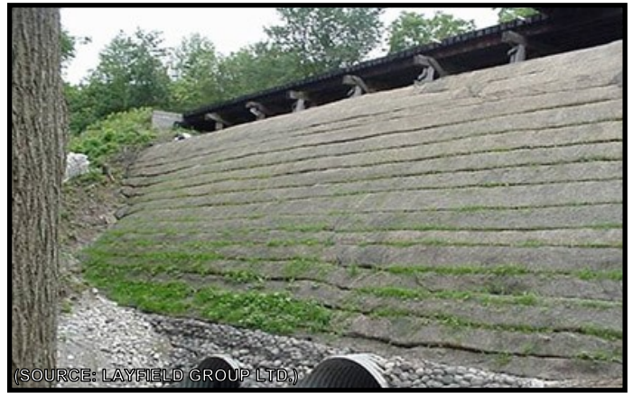
FIGURE 4 AN 80 FT. STEEPLY SLOPED RSS CONSTRUCTED FOR A ROAD EMBANKMENT