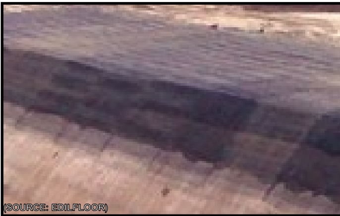
FIGURE 3 A 24 FT. HIGH VERTICAL RSS WALL CONSTRUCTED FOR A LANDFILL

Moreover, this reinforced earth methodology can utilize on-site fine to coarse grained soils (in lieu of much stricter coarse grained fill requirements with other methods). Another benefit is that RSS systems are much more tolerant to differential settlement from compressible foundation soils compared to a retainage system that includes cementitious elements. Under this scenario, for example, MSE walls with concrete facing may be required to be built in stages with temporary facing to avoid facing damage because of the excessive settlement due to wall loads.