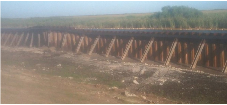
FIGURE 2 VIDEO OF ONGOING BREACH OF THE COFFERDAM DUE TO UNDERSEEPAGE

http://meacorporation.com/wp-content/uploads/093.mov