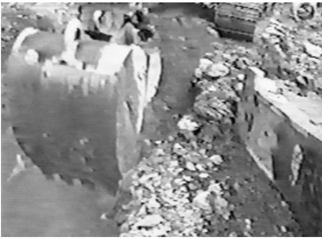
FIGURE 2 PICTURE SHOWS CONTRACTOR USING A 300 HP EXCAVATOR FOR RIPPING ROCK. CONTRACT REQUIRED 160 HP EXCAVATOR TO DETERMINE HARD EXCAVATION QUANTITIES