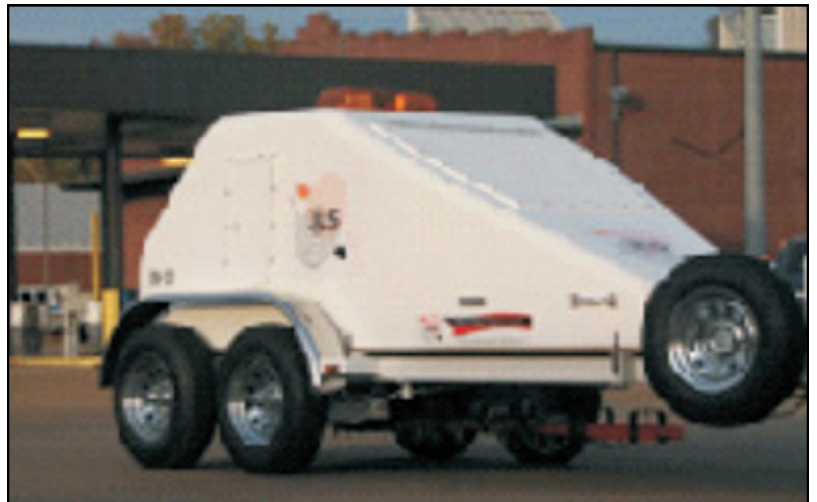
FIGURE 1: FALLING WEIGHT DEFLECTOMOETER (FWD) IN USE

The FWD unit and setup is shown in Figures 1 and 2. The principal findings of the site investigation indicated: the property owner's contracted geotechnical engineering firm misclassified the dominant soil type as mostly clayey silt, which actually contradicted their own mechanical gradation tests that show silt as the smallest soil fraction present. The actual dominant subgrade materials were sandier than considered in the design and, in fact, provided more support than the design anticipated. This