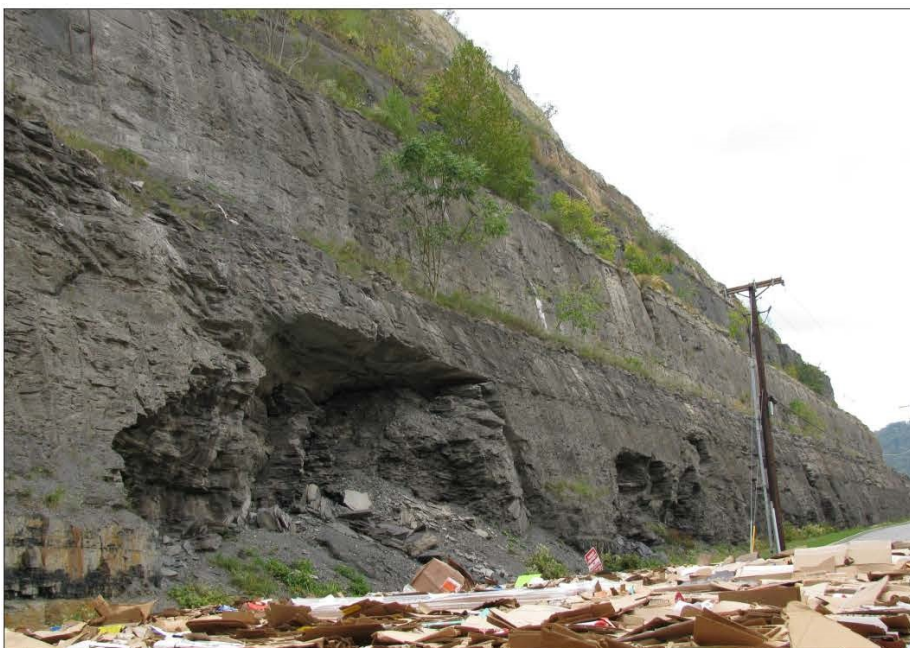
FIGURE 2: MINE OPENINGS IN 400 FT. HIGH ROCK CUT. MINE ROOF CAVED UPWARD OVER TIME.

Based on rock testing and MEA's stability calculations, it was found that the coal mine had limited stability under the northern half of the building which meant there was a high risk of subsidence in the future. However, an acceptable amount of risk existed over the southern portion of the underlying old works (see Figure 1). Therefore, the noted settlement of the building was consistent with the risk analysis performed across the building.